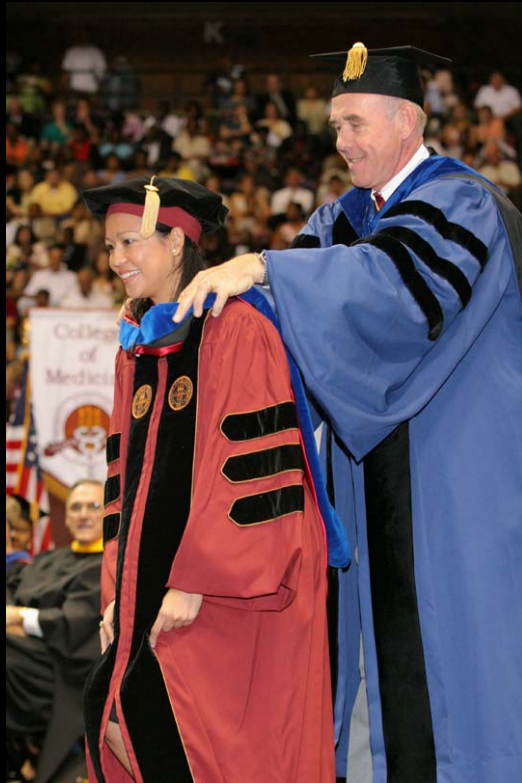
GRADUATE STUDIES AT FSU

"Graduate study is a time of exploration and immersion in a particular specialty. It is a time for the free exchange of ideas, acquisition of new skills, and creation of new knowledge. It is a time when professors change from being your teachers to being mentors and colleagues."